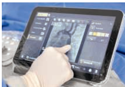
Touch screen module Pro

The standard Windows 10 platform can help support compliance with the latest security and standards to protect patient data. It can also accommodate new software options to extend your system's clinical relevance over time.